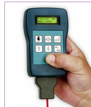
Plug-in type sensor allows one-handed operation

The BTM-400PLUS's LED-optical sensor is unaffected by ambient noise, offering improved performance versus competitive, acoustic sensor-based designs